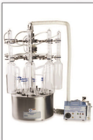
Rotary Liquid-Liquid Extractor