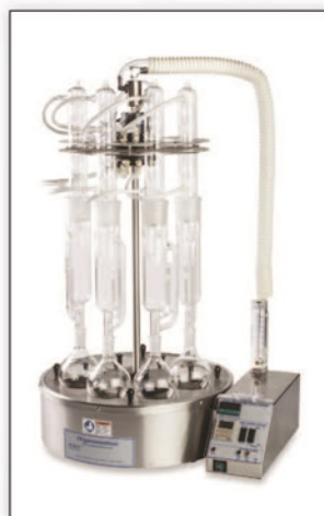
Rotary Solid-Liquid Soxhlet Extractor