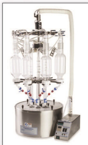
Corning Accelerated One-Step Liquid-Liquid Extractor